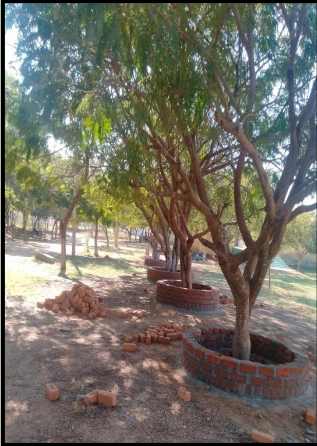
Construction of Tree Gaurds in the College Campus